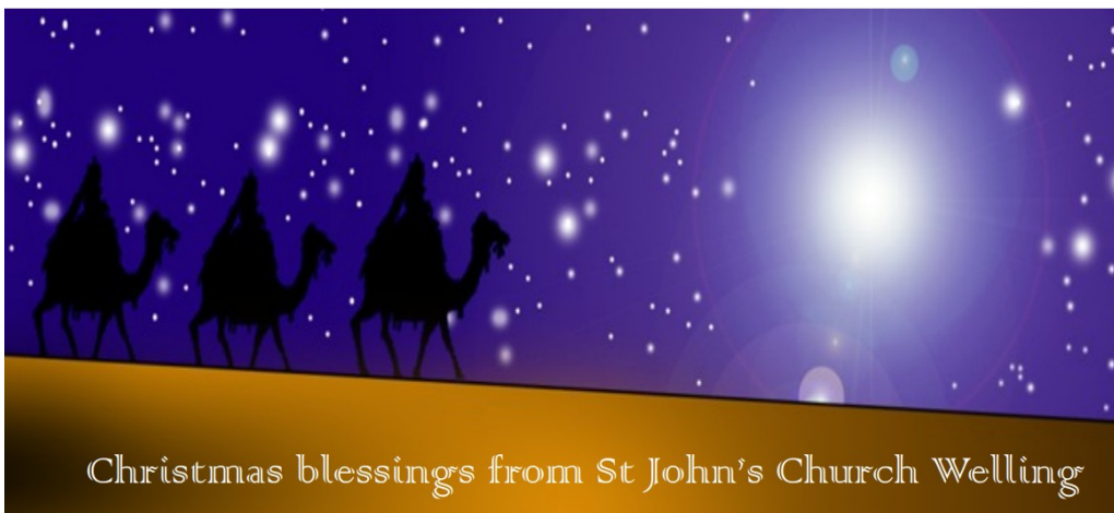
Christmas blessings from St John's Church Welling

The commercial aspects of Christmas deny and hide the pure reality of what happened in Bethlehem over 2000 years ago.