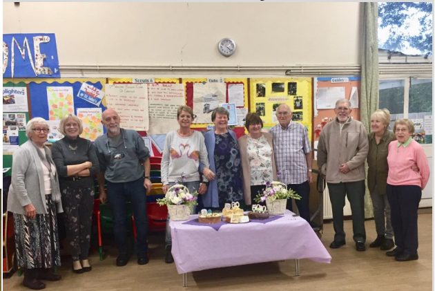
Congratulations to those who celebrated their 'big zero' birthday in St John's Hall this year.