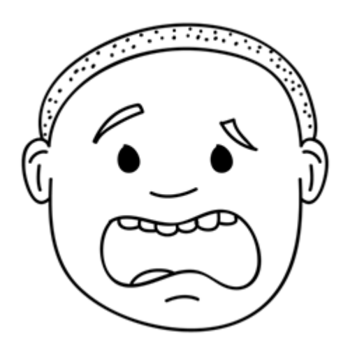
You have a bad dream that makes you scared.