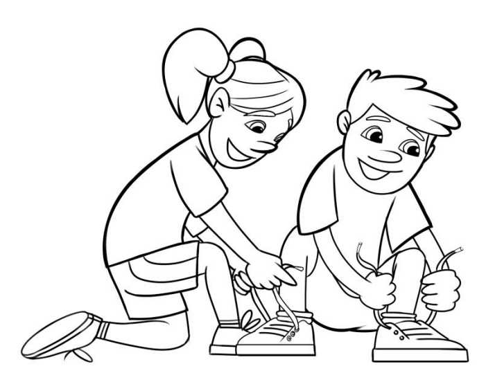
You have trouble tying your shoes by yourself.