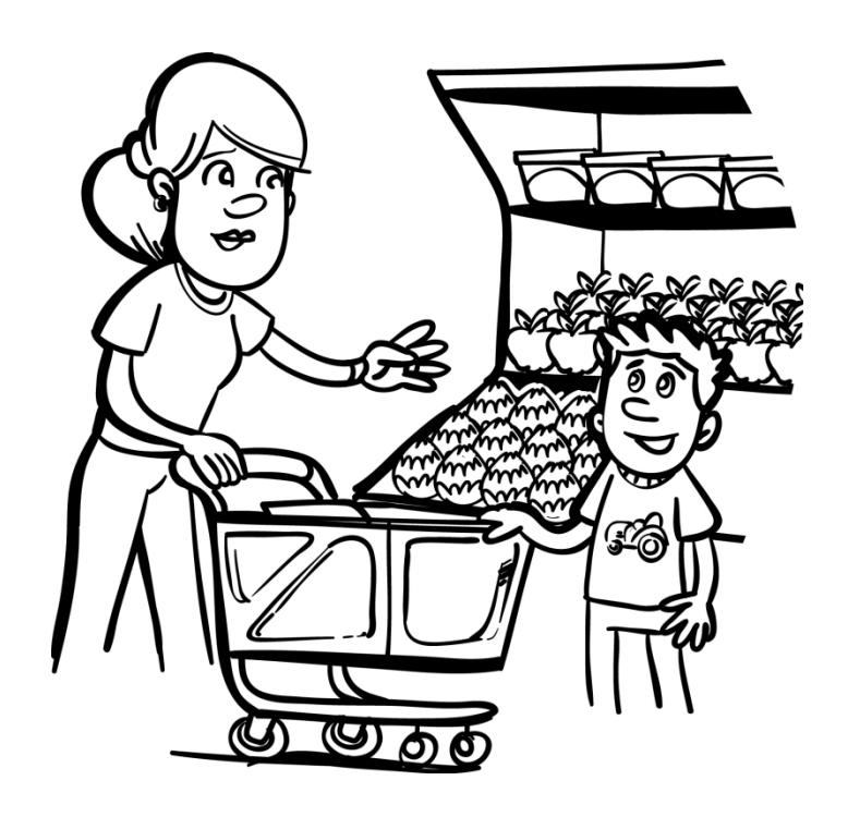
You get lost from your mom in the grocery store.