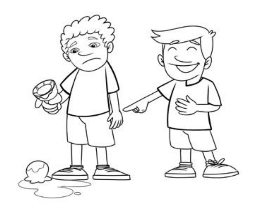
You dropped your ice cream on the floor.