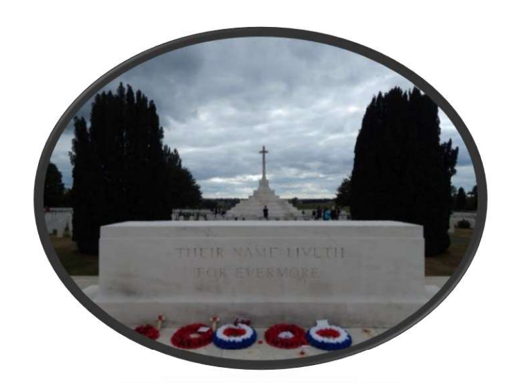
Tyne Cot Memorial, Belgium

As we come to rededicate this War Memorial, which was originally located near the site of Welling Library and unveiled nearly a century ago in March 1921, the church gives thanks to Stephen P Gay Memorials Ltd for carrying out the work and the East Wickham & Welling War Memorial Trust (EWWWMT) for funding the work.